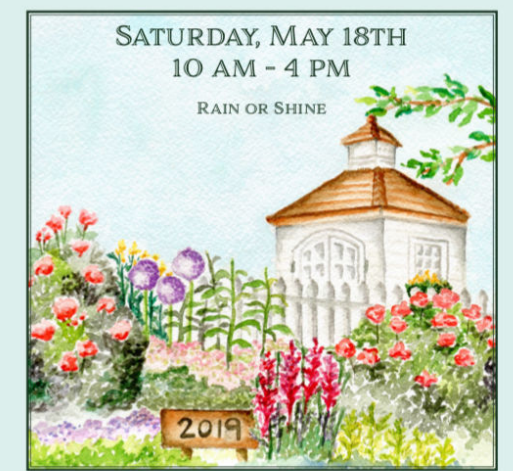
The Garden Club of Chevy Chase hosts A Tour of Eight Charming Private Gardens in Historic Chevy Chase Village

Shop our Garden Boutique with Myrtle Topiaries, Annuals, Herbs and Unique Garden Related Items.